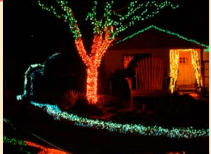
Above: First Place 54 Vendola. Right: Delightful Xmas pig and rocking horse at 802 Rosal.